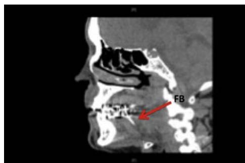
Figure 1. Computed tomography scan showing a foreign body (FB) fishbone appearing vertically, embedded in the tongue.

With POCUS, the fishbone was localized in a different region from the initial superior surface incision and dissection area. A new incision was made under dynamic US guidance with a more lateral and inferior approach. The ENT physician was able to locate the fishbone and remove it at the ED bedside on first attempt with POCUS. After the procedure, the patient was successfully discharged home with instructions for close follow-up.