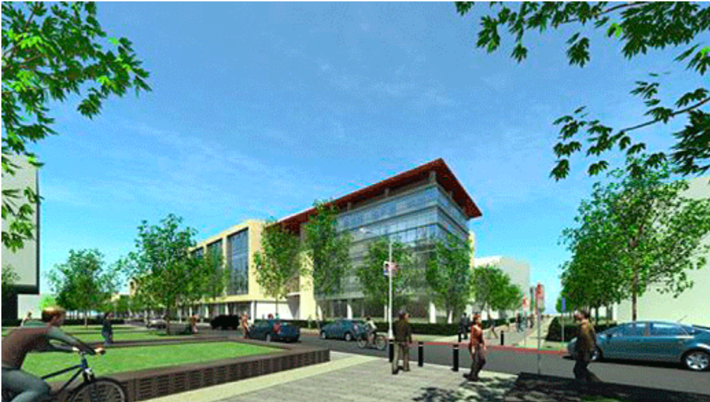
From Academic Walk looking at FIM1 in relation to CCSR