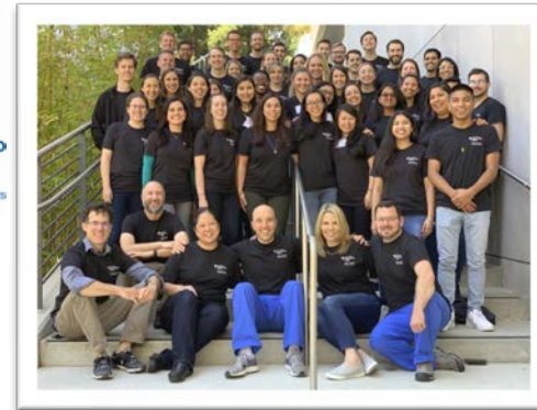
Incoming Fellows from various programs come together for a weekend of hands-on learning, including sessions with The Stanford Virtual