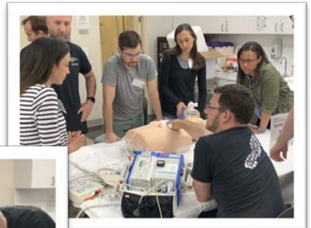
High-fidelity simulation education from world-renowned Stanford cardiologists and cardiac surgeons