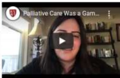
7.30.20: Palliative care was a game changer—an introduction to palliative care

Download the slides to the 7.30.20 presentation HERE