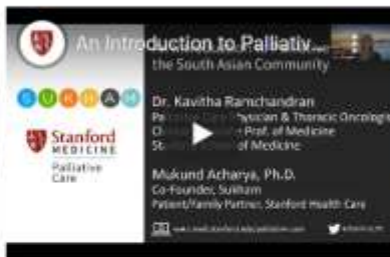
10.22.20: An introduction to palliative care for the South Asian community

Download the slides to the 11.19.20 event HERE