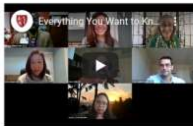
11.19.20: Everything you want to know about palliative care

Video recordings and slides to download of past educational events about palliative care