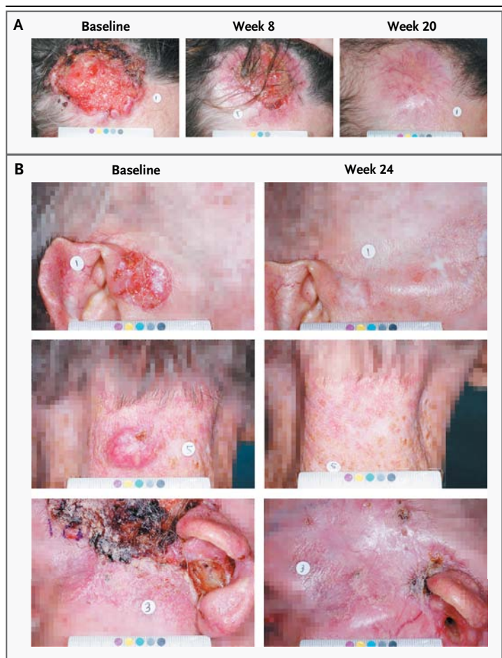
Figure 2. Photographs of Lesions before and during Treatment in Two Patients with Locally Advanced Basal-Cell Carcinoma.

Serious adverse events were reported in 26 patients (25%) (Table 4 in the Supplementary Appendix). Grade 5 (fatal) adverse events were reported in 7 patients (1 with metastatic basal-cell carcinoma and 6 with locally advanced basal-cell carcinoma): death from an unknown cause (in 3 patients) and hypovolemic shock, myocardial infarction, meningial disease, and ischemic