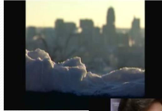
A Lion in the House (2006)