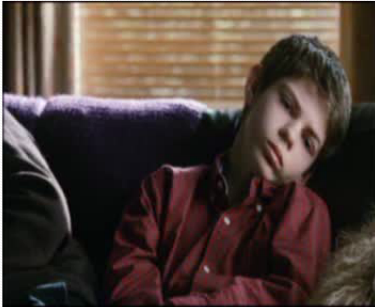
Ways to Live Forever (2010)