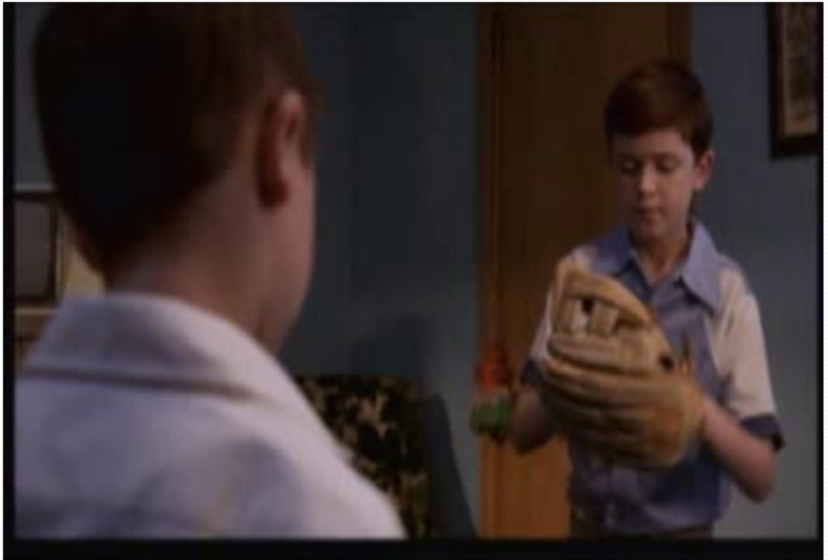
Stolen Summer (2002)