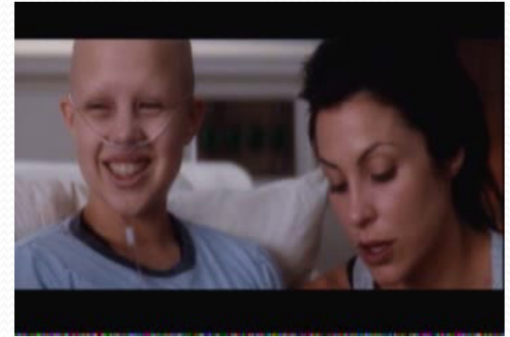
My Sister's Keeper (2009)