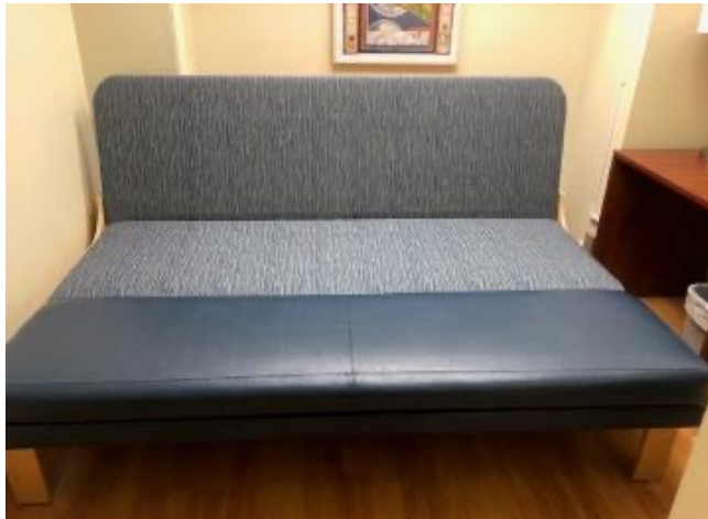
H2271 - Med Team Student Sleep Room