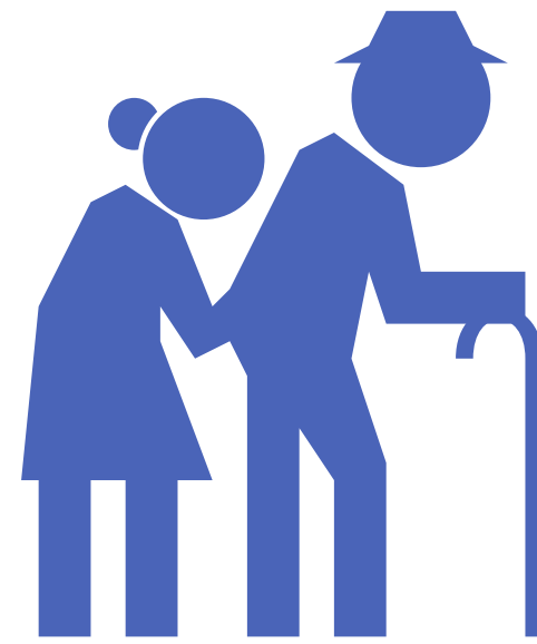
Care for Older Adults