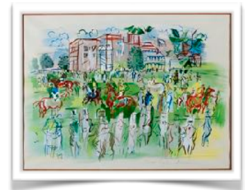
A work by the French-artist, Raoul Dufy in the hospital’s collection.