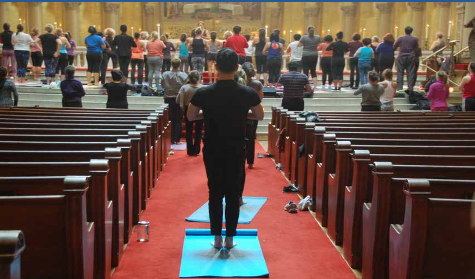
"Om Under the Dome: Yoga in Stanford Memorial Church"