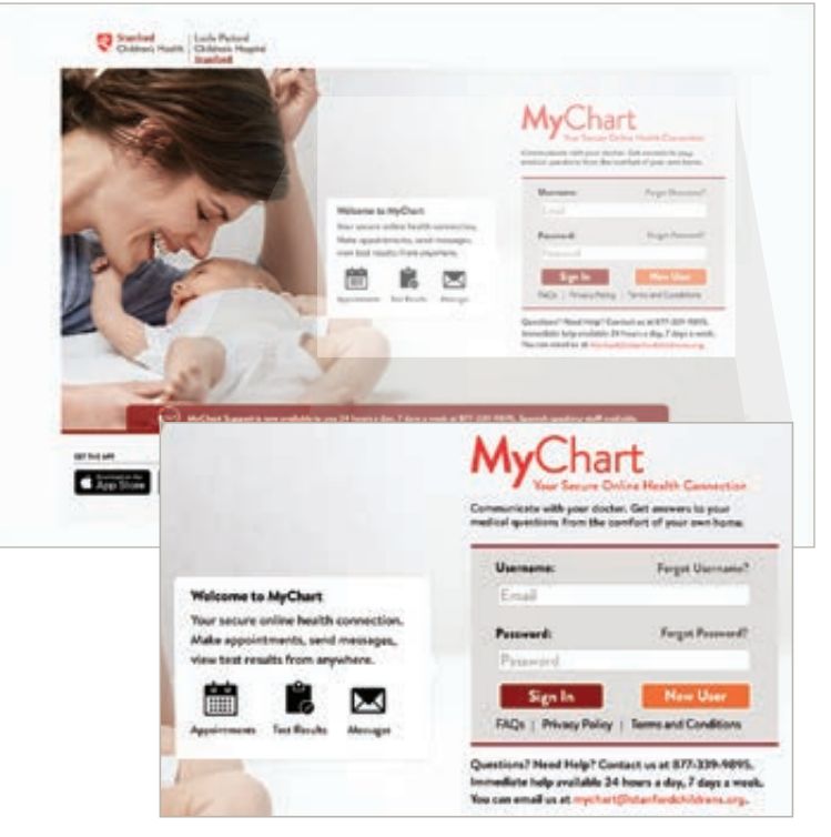
Pre-login box detail