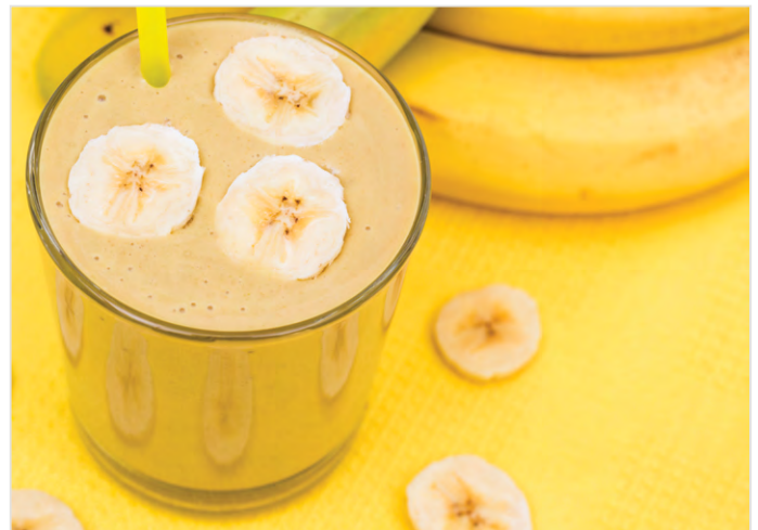
Strawberry-banana and peanut butter smoothie