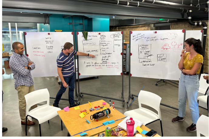
Design day at the d.school