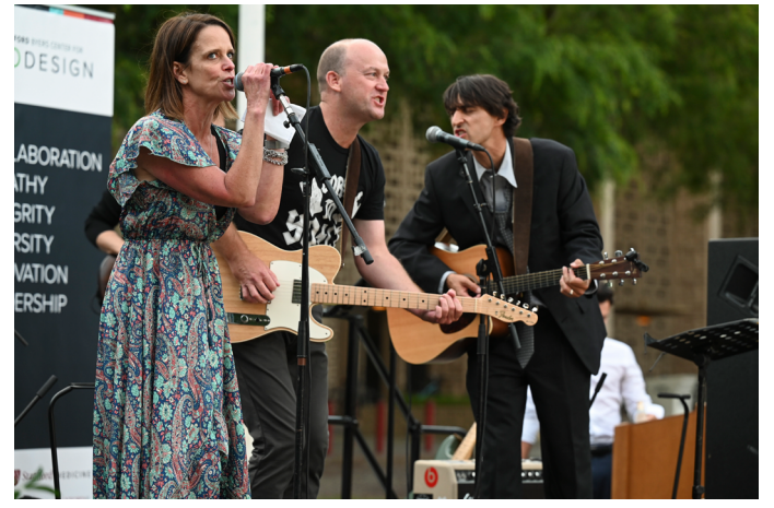
Biodesign's got talent