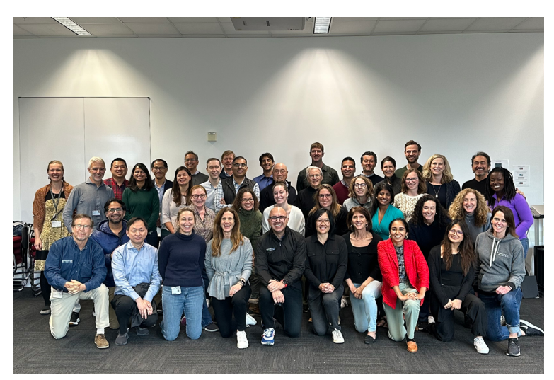
The program team