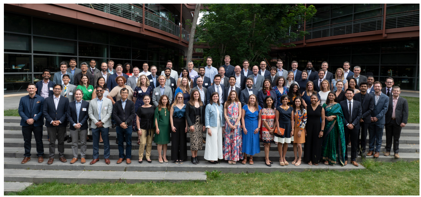
Innovation Fellowship alumni

Technologies invented by these trainees during their Stanford Biodesign training have helped more than 10 million people worldwide.