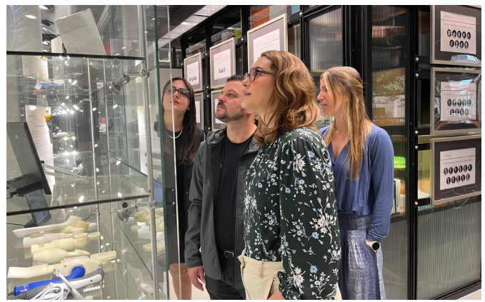
Einstein Fellows reviewing innovation display cases at Stanford Biodesign

2023 also saw the creation of our new Program Development Associate (PDA) offering — a mechanism to provide support and resources to other institutions interested in setting up Biodesign-like programs. Einstein Biodesign, founded in Brazil by former participants in our Global Faculty Training program, is our first PDA. In November, the first cohort of Einstein Fellows joined us for a week to learn more about the Silicon Valley health tech ecosystem.