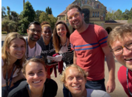
2021-22 Innovation Fellows scavenger hunt