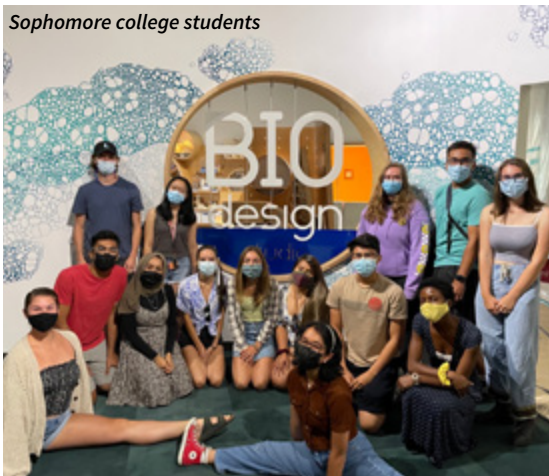
Sophomore college students

others. The 3-week, immersive residential program had two objectives: to give the students an intensive deep-dive into needs finding in healthcare, and to connect students and faculty on a deeper, more personal level than what is typically possible during the school year.