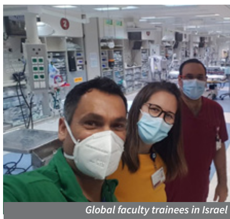
Global faculty trainees in Israel