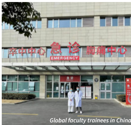
Global faculty trainees in China

January also included the 2021 start of the Global Faculty Training (GFIT) program, which is a five-month experience that teaches participants the biodesign innovation process and how we teach it with the goal of catalyzing similar programs at institutions around the world. This year’s cohort included trainees from China, Israel, and Taiwan. Due to COVID