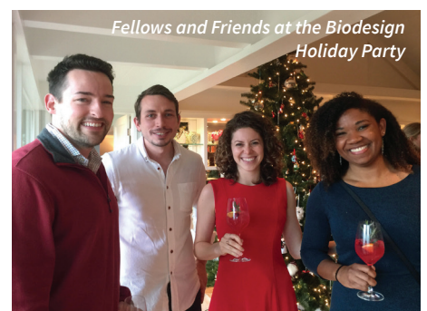
Fellows and Friends at the Biodesign Holiday Party