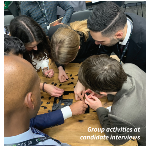
Group activities at candidate interviews

In November, all of team Biodesign, including staff, faculty, industry mentors, and current Innovation Fellows, mobilized for two days of candidate interviews for the 2020-21 Biodesign Innovation Fellowship. The jam-packed 48 hours of individual and group activities is designed to help us get to know the candidates and help them get a sense of our program so that we can assemble high potential, high functioning fellowship teams. We love meeting these talented and accomplished individuals and wish that we could accommodate all of them in our programs. The new class of fellows will be announced in spring 2020.