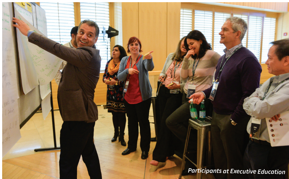
Participants at Executive Education

Each year, far fewer medical devices are approved by the US FDA for children than adults. To help address this shortfall, the UCSF-Stanford Pediatric Device Consortium was formed to help innovators develop promising ideas into patient-ready products. The first round of proposals for the consortium’s direct funding program were due in February; innovators submitted concepts for consideration to win up to $50k in seed funding, prototyping support, and advising. The partnership, which is funded