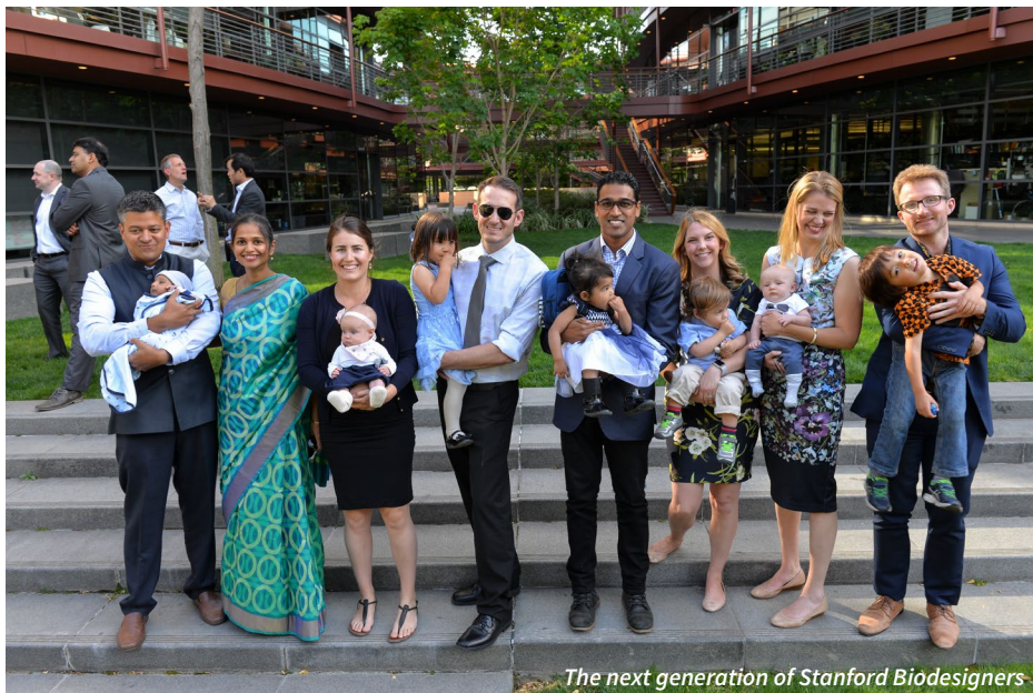
The next generation of Stanford Biodesigners