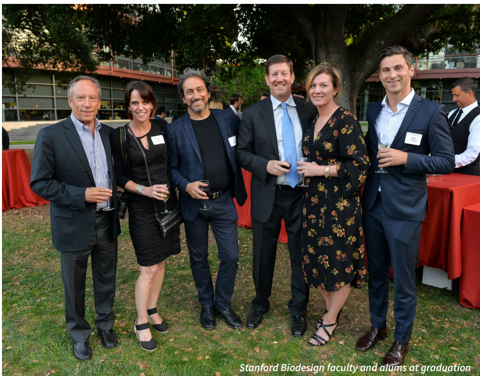
Stanford Biodesign faculty and alums at graduation

For other information about Stanford Biodesign, email Stacey McCutcheon at staceypm@stanford.edu or visit us online .