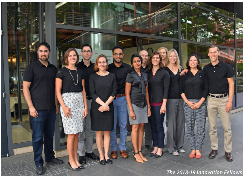
The 2018-19 Innovation Fellows