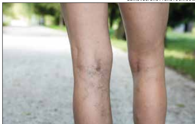
Varicose veins affect 30 million people across the United States.