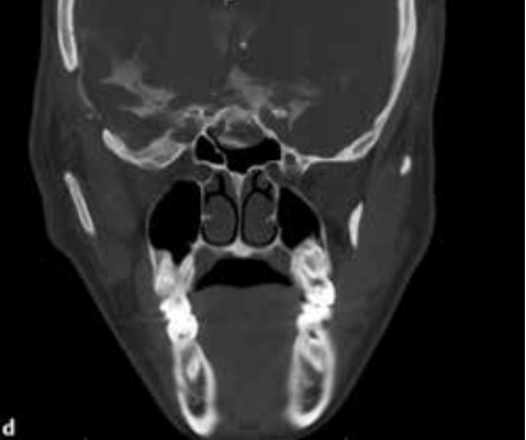
Fig. 1 Head computed tomography (CT) on presentation showing a large right frontal lobe contusion with overlying depressed skull fracture (a), Axial (b) and coronal (c) maxillofacial CT on admission demonstrating sphenoid bone (anterior clinoid) fractures with a free bone fragment in the sphenoid sinus. (d) Coronal CT cisternogram showing diaphgrama incompetence and fluid draining into the sphenoid sinus.

which includes frontal bone, ethmoid bone, cribiform plate and sphenoid bone. The anterior skull base is divided into medial and lateral portions: medially, the rhinobase (nose and paranasal sinuses) and laterally, the orbits and the lesser wings of the sphenoid. The smaller and farther the fracture from midline, the lower the rate of infection with CSF leakage. Radiographically, these anterior fractures have been divided into four types: cribiform plate, frontoethmoidal, lateral frontal and complex fractures (3). Facial fractures involve the cranimaxillofacial bony anatomy, which include the mandible, maxilla, zygoma, facial sinuses, frontal bone, orbit, cribriform plate and sphenoid bones.