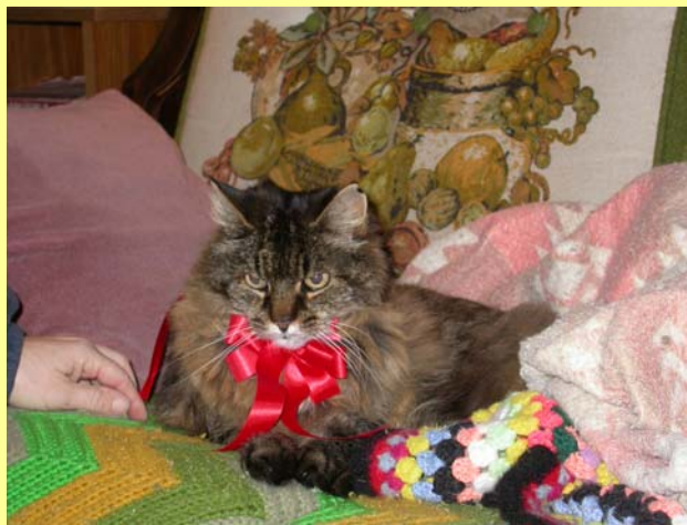
C-Myc Dundee (1989-2008)

tolerant, liked to be around me or anyone who was at the house - yet never demanded attention. Like all cats - in their 2nd decade - he developed renal failure - and though it has been a very chronic process (he was 19.5 yrs old) - and he was compensating well for the past couple years - he started going downhill rapidly late in August. Despite his love of life and will to live - it became readily apparent that the line of "quality of life" had been crossed and his weeks of inappetence, ever worsening anemia (side effect of chronic renal failure), and inability to walk more than a few steps before sitting and resting - dictated the most difficult decision I had ever had to make - to have him put to sleep. My initial email to the pre-vets and Stanford alumni elicited some great responses on the comments I made regarding the practice of euthanasia, and I also appreciate very much all of your supportive feedback and compassionate words at that very difficult time. So let's all raise a glass this holiday season - in honor of Myc, and any other pets that may have brought joy into our lives - we are truly blessed by the animals we care for and who care for us!